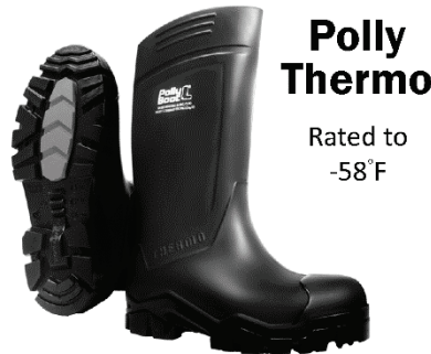
Polly Thermo Rated to -58°F