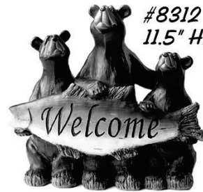
#8312 11.5" HIGH BEAR WELCOME