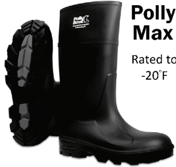
Polly Max Rated to -20°F