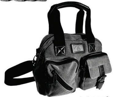
New! #4019 TEAL 13"W PURSE