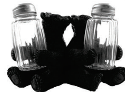
#5430 KISSING BEARS S & P HOLDER 5.9"