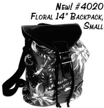
New! #4020 FLORAL 14" BACKPACK, SMALL