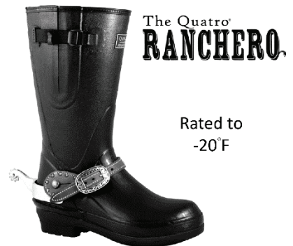
The Quatro RANCHERO Rated to -20°F