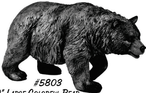
#5803 10" LARGE COLORFUL BEAR