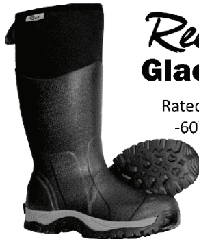
Reed Glacier Rated to -60°F