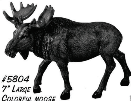
#5804 7" LARGE COLORFUL MOOSE