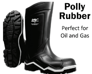
Polly Rubber Perfect for Oil and Gas