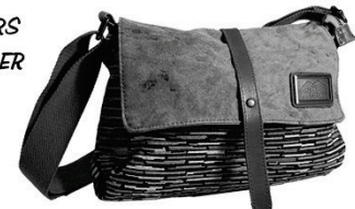
New! #4018P & 4018Q WASHED GREEN OR PEACH CANVAS & BROCADE PURSE