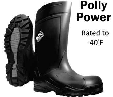
Polly Power Rated to -40°F