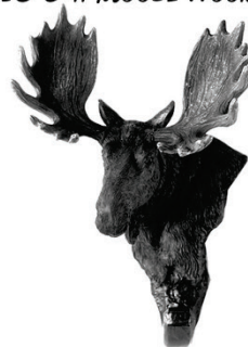
#5018 6"H MOOSE HOOK