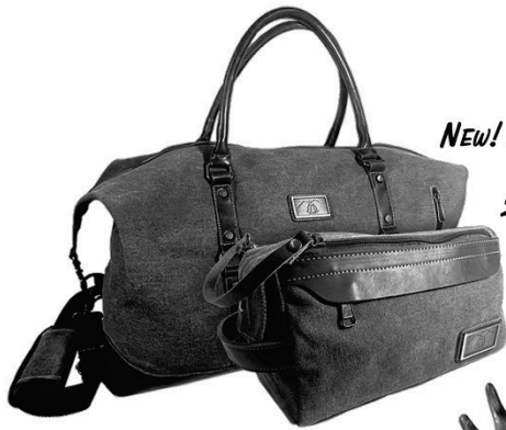
New! #4026 & 4025 MATCHING GREY 24" TRAVEL BAG & 10" TOILETRY BAG *SOLD SEPARATELY