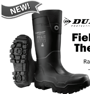
DUNLOP PROTECTIVE FOOTWEAR FieldPro Thermo Rated to -76°F